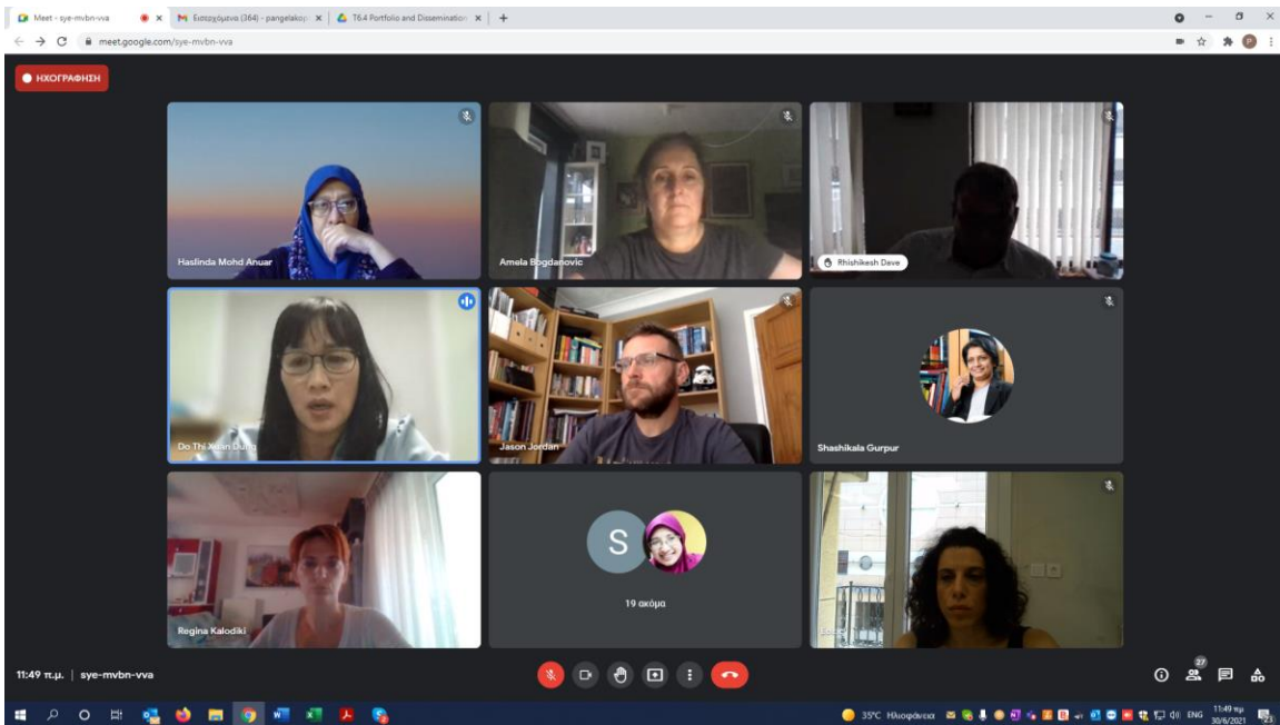
Team Leaders during Kick off Meeting