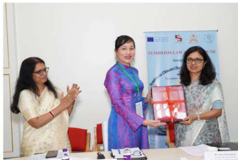
Interaction with the International Delegation at S.B Road.