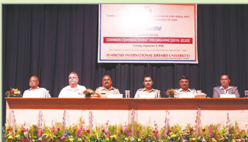
Panel Discussion on "Maintenance of Law and Order and Prevention of Substance Abuse" by Pune City Police

The Common Commencement Programme for the first year students of Symbiosis Law School, Pune, Symbiosis School for Liberal Arts and Symbiosis School for International Studies was organized on 3rd September 2019.