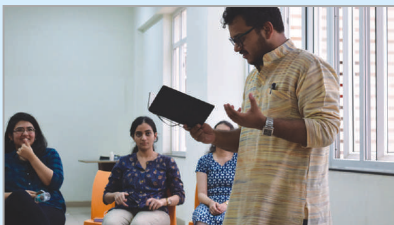
Students performing poetry at the Open Mic event, "Lines to Life" hosted by Law Hawks

The objective of the forum is to illustrate the potential of creativity, innovation and expertise through the nourishment of discourse and ideation for students with a creative bent of mind.