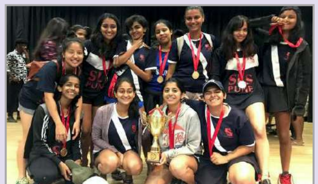
SLS Women's Football Team, 1st Position, Yuvardha '19, NLU Jodhpur Sports Fest