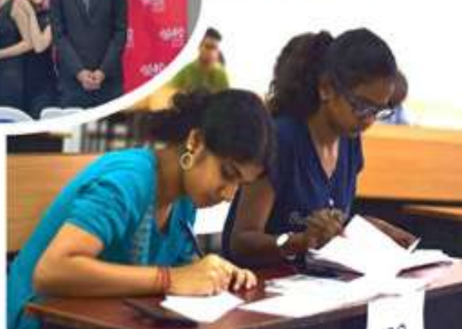
Collage of photos of Students' achievements in various Debating events