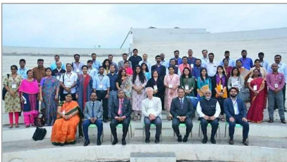
Faculty from SLS-P and SLS-H at the Faculty Development Programme held at Symbiosis Law School, Hyderabad