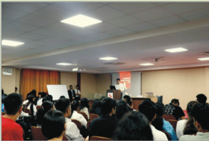
Open Forum on the topic, "Extrajudicial Killings" hosted by International Cell and Human Right Cell