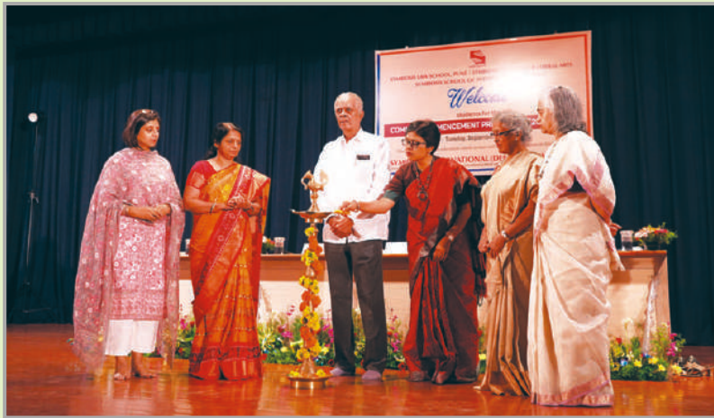
Lighting of the lamp by dignitaries of SIU.