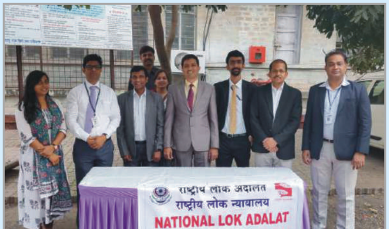
CLCL Cell at the National Lok Adalat, 2019