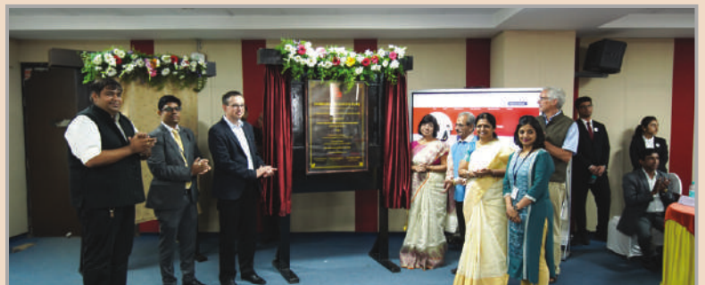
Release of LexEt and introduction of the Symbiosis Centre for Alternative Dispute Resolution (SCADR), and the Symbiosis Legal Skills Centre