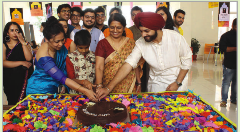
cake cutting ceremony