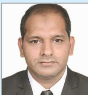
Judge Rehan Raza, Civil Judge, High Court of Judicature at Patna