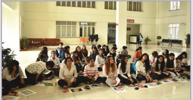
Students participating in the Art Workshop, Et Iris '19

Et Iris '19 also hosted a pottery workshop with traditional potters from Kumbhardwada, as well as Spoken Word in the Tell a Tale Open Mic, where students gave live performance.