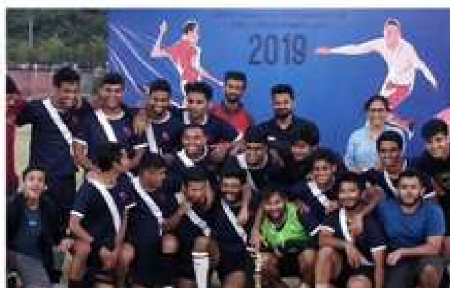
Collage of photos of Students' achievements in various sporting events