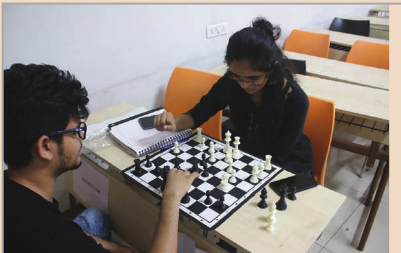
Students playing chess