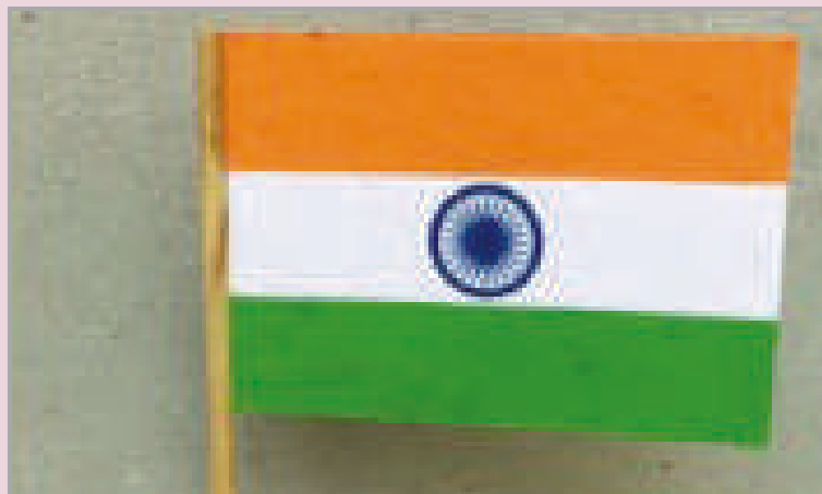
National Flags made out of seed waste cotton and marigold seeds