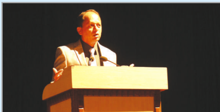
Hon'ble Justice Ravindra Vithalrao Ghuge, Judge, Bombay High Court

A Guest Lecture was conducted by Hon'ble Justice Ravindra Vithalrao Ghuge, Judge, Bombay High Court on "International Labour Organization and its relevance in India" on 10th September 2019 for the students of 3rd year BA/BBA LLB Hons.