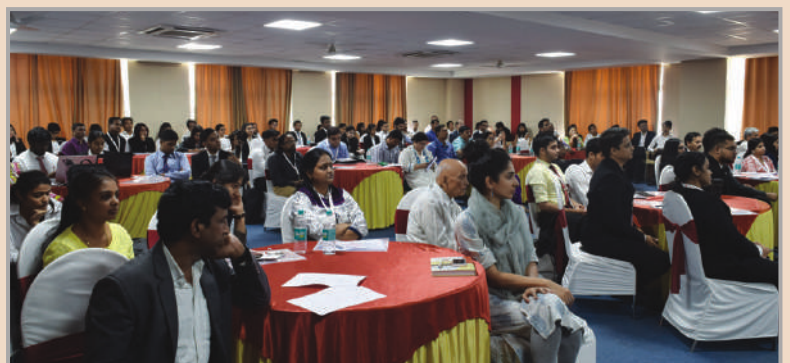
Participants and attendees symprolic