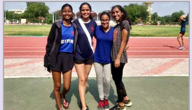
SLS Women's Relay Team, 2nd Position, Yuvardha '19, NLU Jodhpur Sports Fest

After the events, the selection committee appointed by the University Sports Board provisionally selected players to represent the Symbiosis International University at Inter-Varsity West – Zone (Men/ Women) Competition.