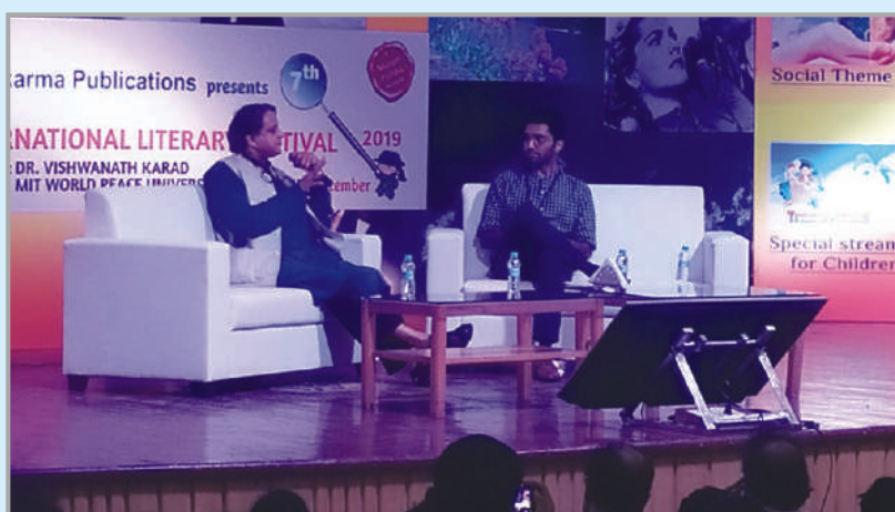
Students witnessing session by Dr. Shashi Tharoor at the Pune International Literary Festival