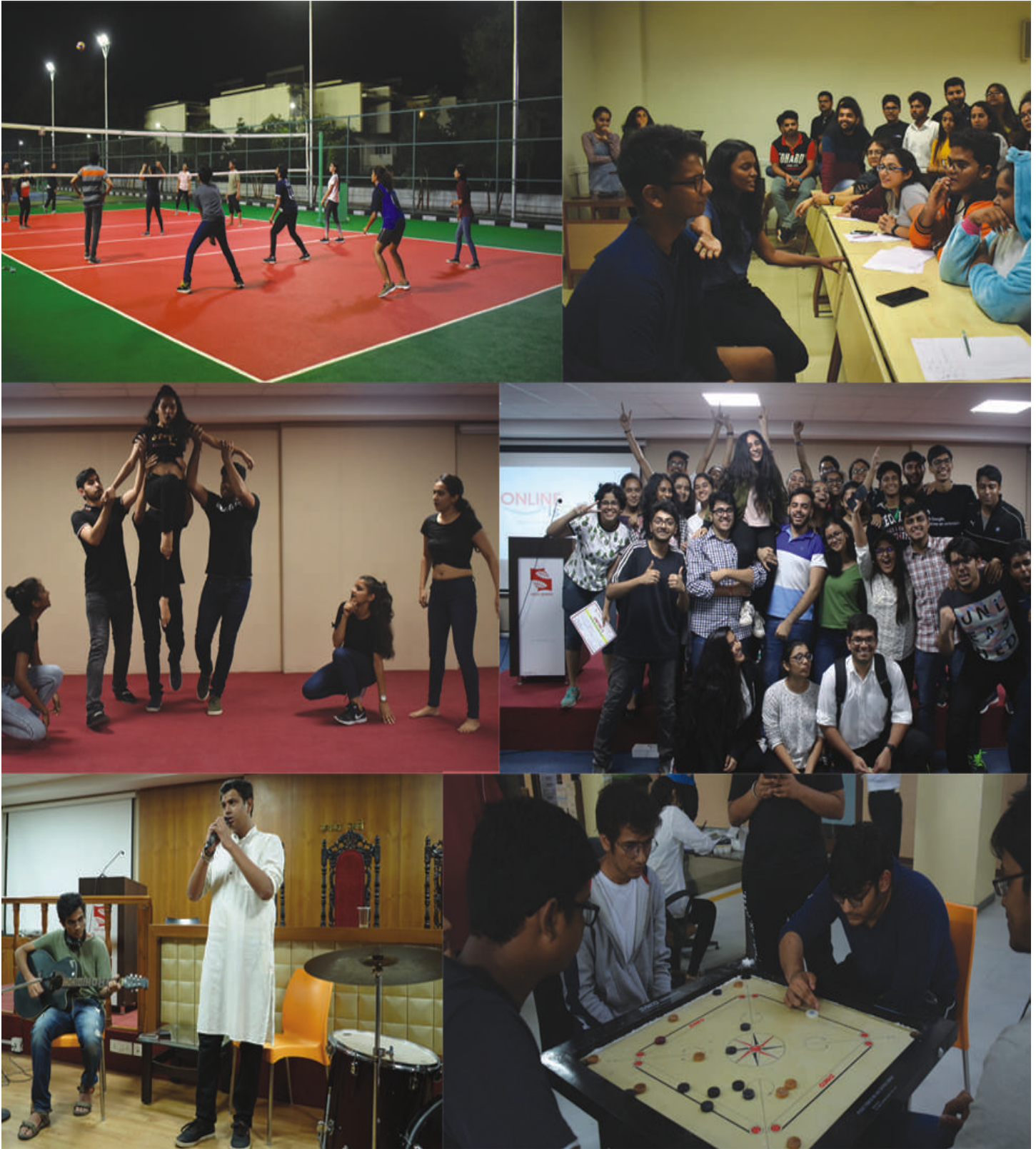
Collage of Photos from various events of Symptoms 2019