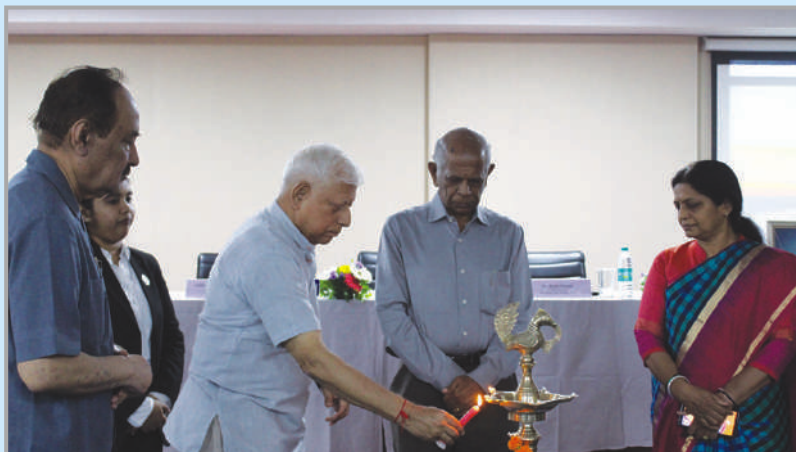
Lighting of the Lamp by the dignitaries