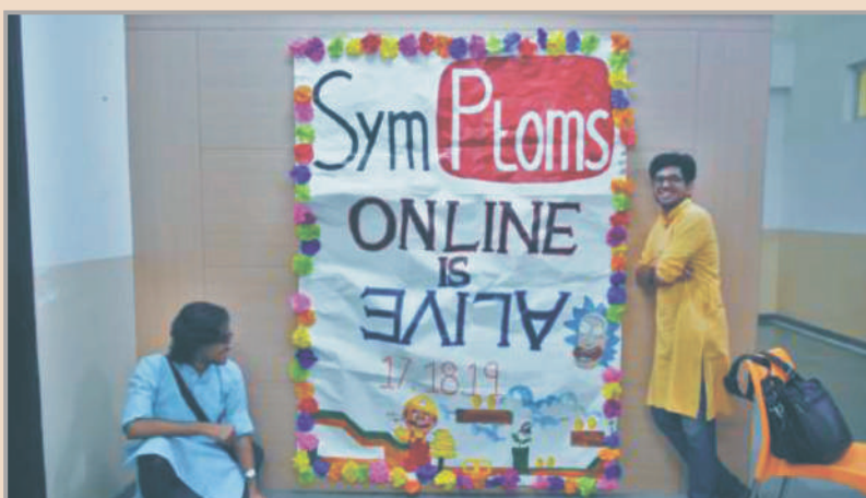
Decoration for Symptoms

Symptoms, the intra-college cultural and sports fest, was conducted by the Extra Curricular Cell of Symbiosis Law School, Pune from 17th to the 19th of September, 2019. Symptoms 2019 aimed at encouraging the first years to showcase and explore their talents.