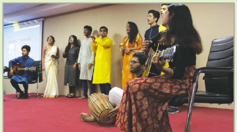
Students performing a musical rendition for teachers

Dr. Shashikala Gurpur addressed the gathering on the importance of the teaching force that serves as the backbone of the college. The festivities of the day comprised of dance performances, a drama skit, musical acts performed by the students, a karaoke session for the amusement of the teaching staff and an award ceremony, wherein teachers were bestowed with different titles which encapsulated their unique personality traits.