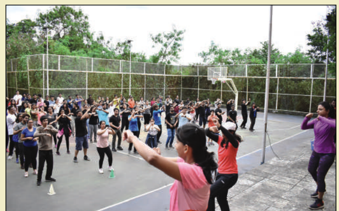
SAB engaging in team-building exercises and games