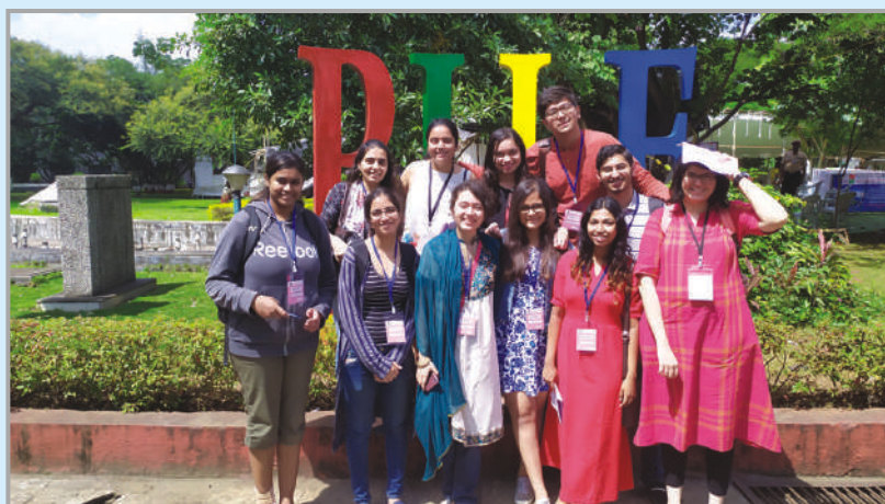
Law Hawks students attending event