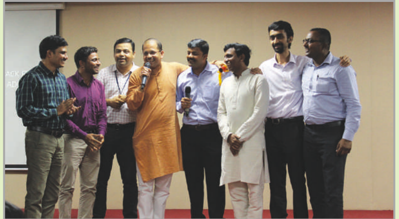
Teachers in the midst of a karaoke session hosted by students

The students of Symbiosis Law School, Pune celebrated the occasion of Teacher's Day with great pomp and zeal on the 5th of September 2019. The theme for the celebration was 'Pushkar Mela' and all the vibrant decorations in the corridors and the halls of the college reflected the same.