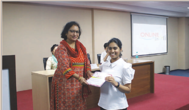
Winner of various events of Symptoms being felicitated