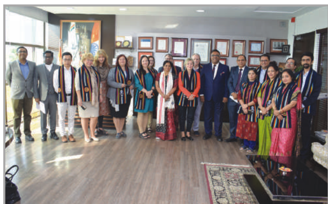
Representatives of OP Jindal Global University, Symbiosis Law School, Pune, Guangdong University of Foreign Studies, Guangdong, Beijing Foreign Studies University, Beijing, China