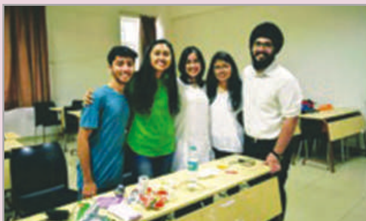
"Waste! Make Haste" event organized by ECOCON Cell during Symptoms '19