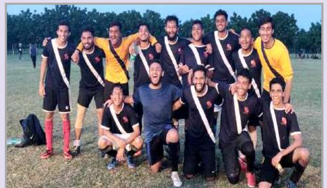
SLS Men's Football Team, 1st Position, Yuvardha '19, NLU Jodhpur Sports Fest