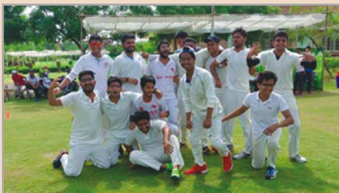
SLS Men's Cricket Team, Third Position, Yuvardha '19, NLU Jodhpur Sports Fest