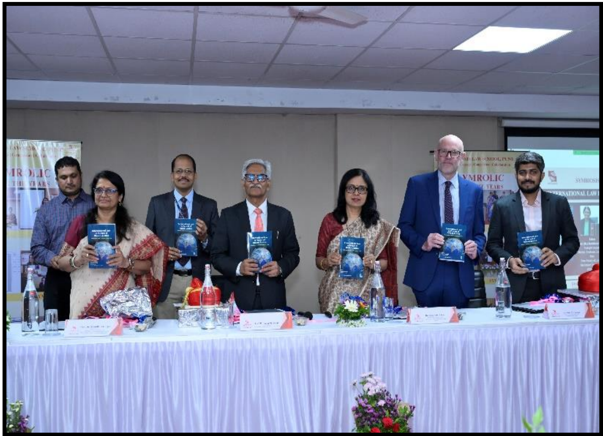
13th Annual International Research Conference - "Rule of Law in Context: Just World Order, Digital Life, AI, and Emerging Technologies." (SYMROLIC 2025)

Symbiosis Law School, Pune, a constituent of Symbiosis International (Deemed University), hosted SYMROLIC 2025 in association with SLS, Hyderabad, SLS, Nagpur, and SLS, NOIDA in hybrid mode on 25 th and 26 th April, 2025.