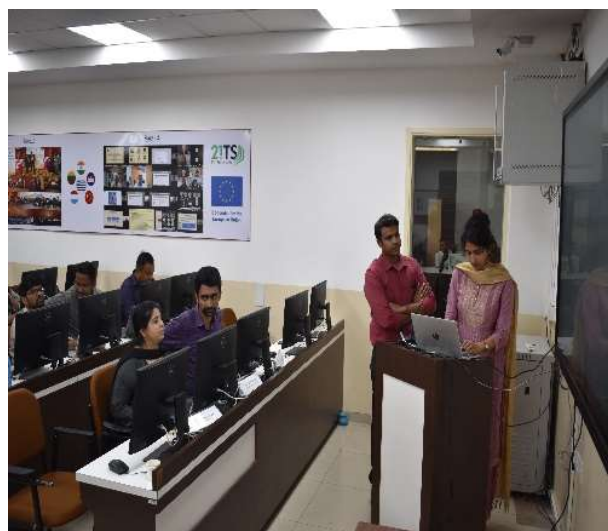
21 st TS Team, SLS Pune addressing the participants on hybrid mode