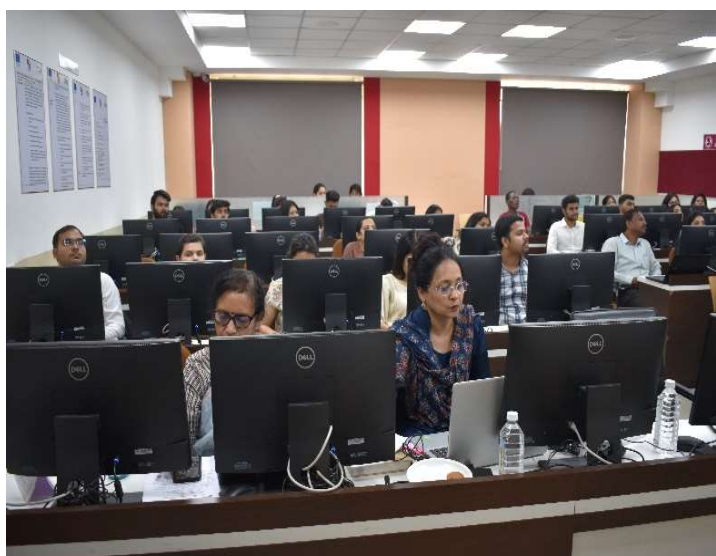
Participants attending the orientation session on the 21 st Teach Skills Certificate Program