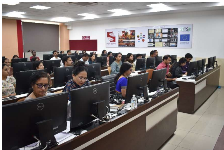
Participants attending the orientation session on the 21 st Teach Skills Certificate Program

The orientation program provided the necessary handholding to the participants regarding registration on the platform and the assessment plan.