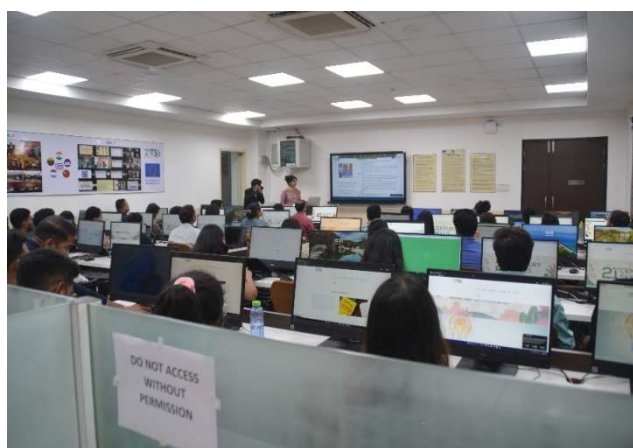
Participants attending the orientation session on the 21 st Teach Skills Certificate Program

Further, team of SCES/SLS Pune took the participants through the project journey and told them about the development of the 4 modules by the participating HEIs. She informed the participants about the 4 modules that were developed namely on ‘Teaching Critical Thinking and Collaborative Problem-Solving Skills’, ‘Education Technology Skills’, ‘Authentic Learning Tasks’, and ‘Optimizing Assessment for 21st Century Skills’.