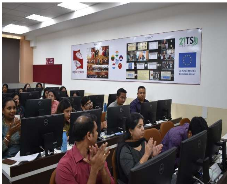
Participants and Trainers attending the orientation session on the 21 st Teach Skills Certificate Program

Imbibing 21st century skills will provide students with a winning edge over others. It would prepare them to take up leadership roles in the digital age and would enable them to shine as job creators. It will also motivate them for lifelong learning.